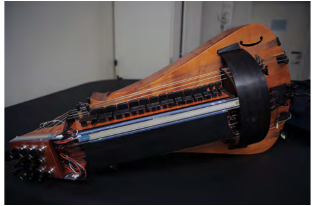
Figure 2. The developed Hyper-Hurdy-Gurdy.

In each of the four ribbon-pressure sensor pairs, the ribbon sensor was attached, thanks to its adhesive film, on top of the pressure sensor in order to create a unique device capable of providing simultaneous information about position and pressure of the finger interacting with it. The pressure sensor was in turn attached, thanks to its adhesive film, to a plastic rigid support, which was appropriately cut in order to meet the size of the sensors. This support was involved for two reasons. The first one was that placing the sensors directly on the instrument did not allow an optimal tracking of the forces and positions exerted by the fingers on the sensors due to the fact that in some cases (e.g., the keyboard box) the wood could slightly move up and down, and a more rigid, homogenous, and stable base was needed. The second one was that thanks to the support the created device could be easily attached or removed to the