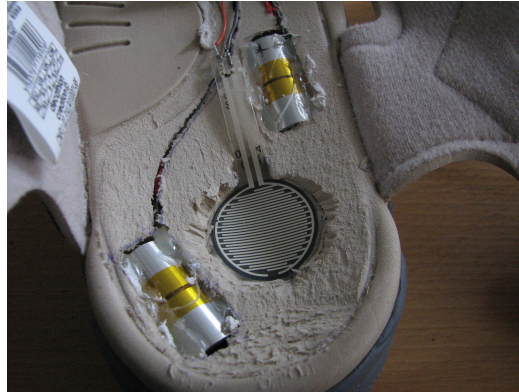
Fig. 2. A picture of one pressure sensor and two actuators embedded in the shoes.